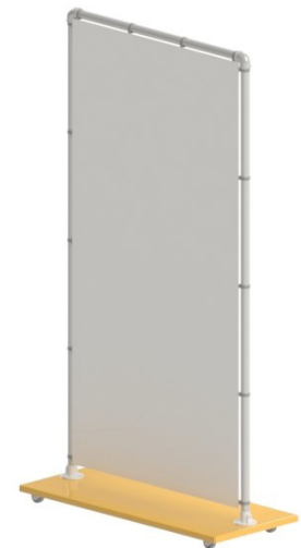
Free Standing Partition